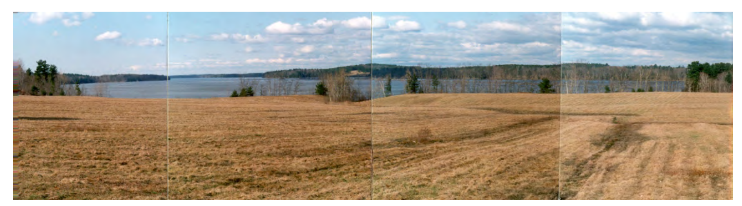
Choice View Farm, Route 128, Dresden Acquired with LMF funds. Home to a healthy population of purple loosestrife.