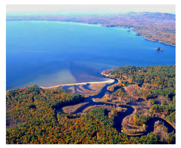
Songo-Crooked River Mouth

"The precise legal issue presented is whether Congress authorized the States to require compliance with State water quality standards under Section 401 of the Clean Water Act, 33 U.S.C. § 1341. For more than 100 years, petitioner has operated its hydroelectric facilities on the Presumpscot River with little regard for the adverse impact on water quality. Dammed from stem to stern, the river has witnessed a profound decline in water quality and the consequent extirpation of its once prodigious sea-run fishery."