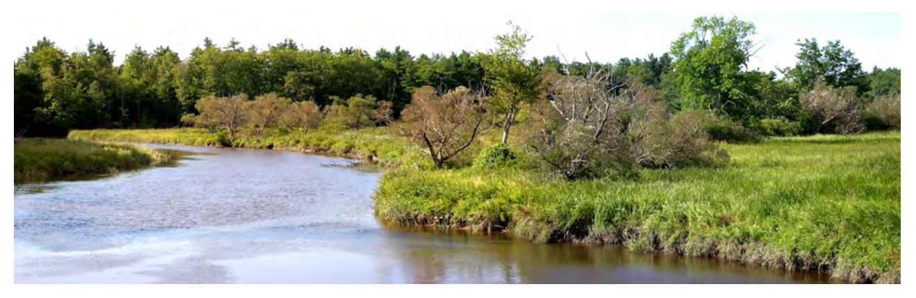
Gallant Parcel, Abbagadassett River

Securing guaranteed public access to the outdoors has been central to LMF's mission from the beginning. Through the addition of new public lands, the program has greatly expanded the availability of world-class outdoor recreational opportunities for citizens and visitors alike. Thanks to LMF dollars, thousands of acres around Merrymeeting Bay and the lower Kennebec have been protected in perpetuity.