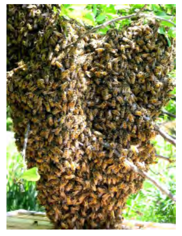
Honey Bee Swarm

The Maine Department of Transportation has begun a two-year study of roadside habitats along state highways in cooperation with the Maine Natural Areas Program of the Department of Agriculture, Conservation, and Forestry. The study will define various habitats occurring in roadside areas and how they are used by pollinators. This information will provide a baseline of typical roadside habitats and plant species to improve vegetation management decisions that will benefit these insects. The importance of pollinators has gained attention in the United State and the world in recent years as honeybees have begun to decline and are continually threatened. Efforts are underway across the country to better understand how to manage and improve habitats for pollinators and restore their population numbers.